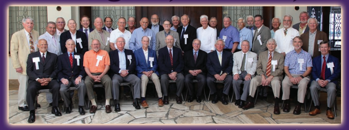
Class members in the photograph are identified on page 31.